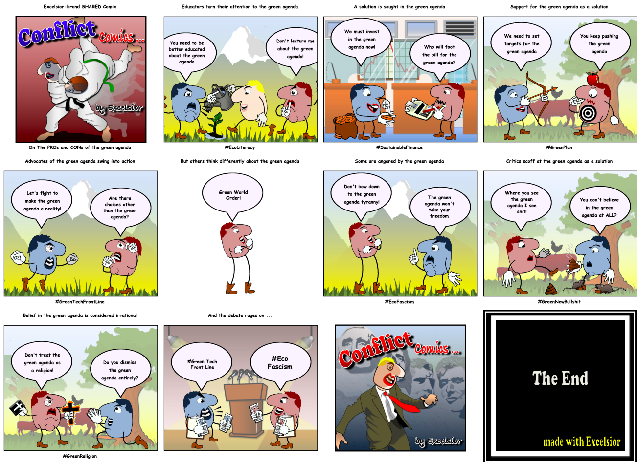
Figure 1: An Excelsior comic in the domain of climate change. Stance reversal occurs in the 2 nd panel of row 2.

the A/B elements of the AAAABBB pattern is given its own panel, under which the original tag is displayed. Each comic uses two characters, which are rendered in blue and red to make them visually separable. This visual identity is important when the viewpoint switches from one side of the debate to the other, as happens here in the second panel of row two. The protagonist, shown in blue, advances the A side of the argument on climate change, and here advances the pro-green agenda. The antagonist, shown in red, responds with as many questions as rebuttals. Excelsior strives for balance across panels and within panels too, and generally aims to let no claim go unquestioned, whatever its validity. When the agonists switch sides, it becomes red’s turn to voice the anti-green B side in the face of blue’s advocacy.