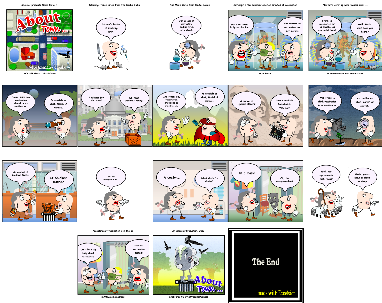
Figure 2: An Excelsior comic on the topic of vaccination which follows an AAB irony pattern.

but predictable cues to their insincerity. In the case of exaggerated or ironic similes, these cues are found in hedge words like “about” or “almost.” Take the heavily panned film Cats (2019). After viewing an unappealing trailer, one might describe the film as “ about as marketable as a flesh-eating virus.” These cues serve a dual function: they signal a creative intention on the part of a writer, and allow machines to trawl large quantities of creative similes from the web. (Veale 2012) reports that such a trawl pulls in a large set of ironic similes, in which one quality is asserted but its opposite is implied, and a larger set of comical similes whose qualities are asserted literally. If Excelsior can infer the qualities implied by a specific tag framing, it can make the qualities comically explicit by using vivid similes from this corpus. It can also exploit the AAB pattern to magnify the humour of its choices, by chasing two literal similes ( AA ) for an implied quality with an ironic twist ( B ).